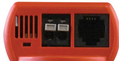
Reset Button Switch Sensor Contact Set External Environment Sensor Channel